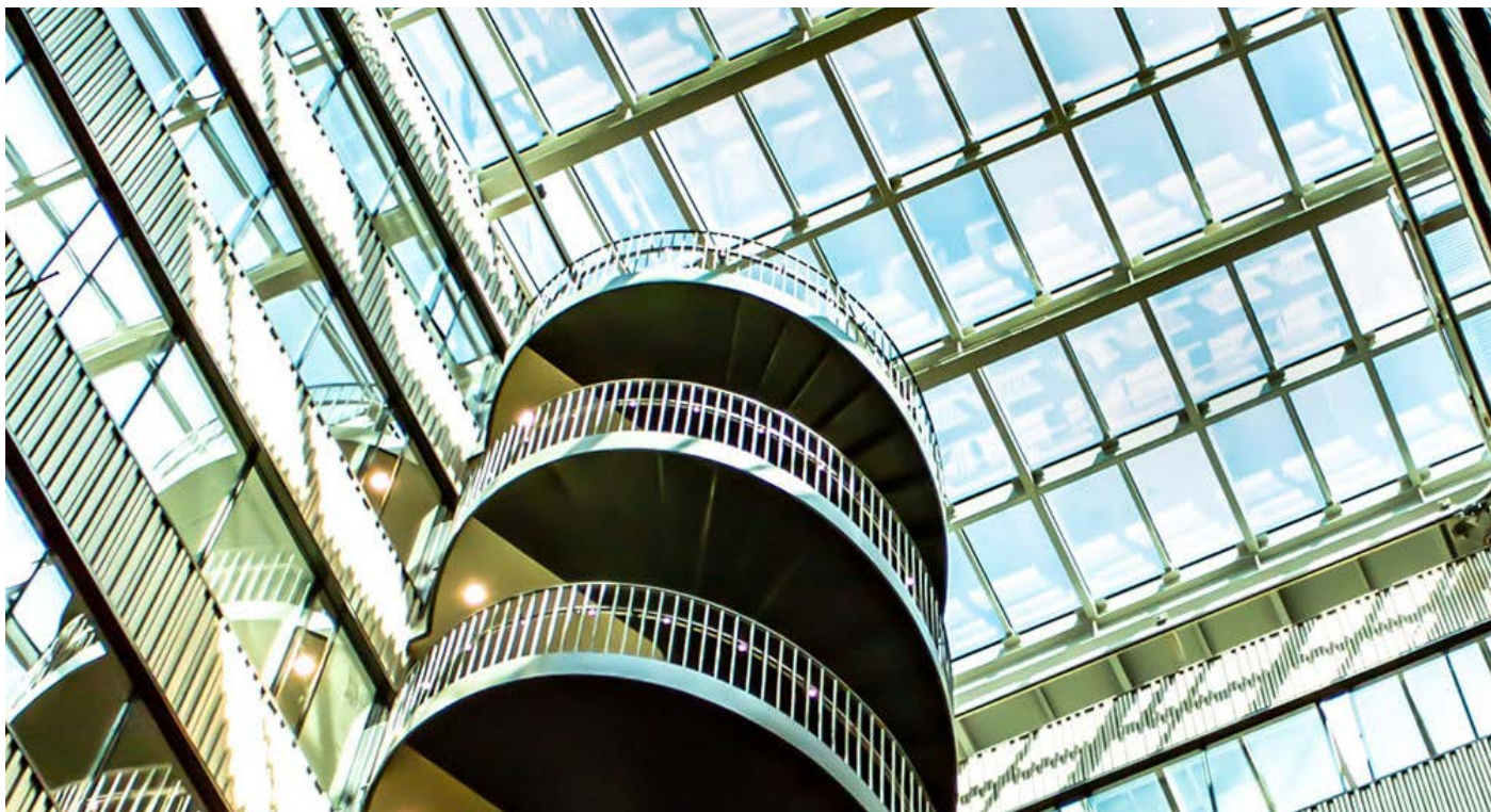
Office Building, Uppsala, Sweden